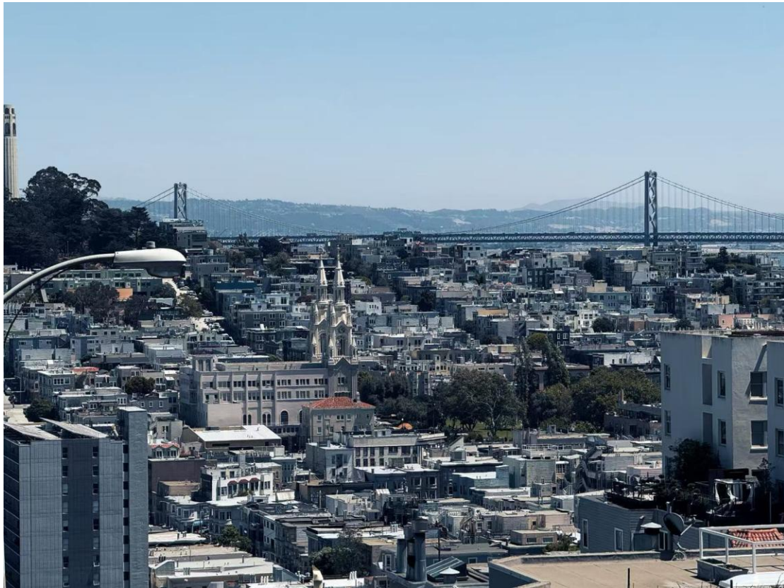
Figure 7: View from above

We also went to the northwest part of the city to take in the view from above and enjoy the cityscape.