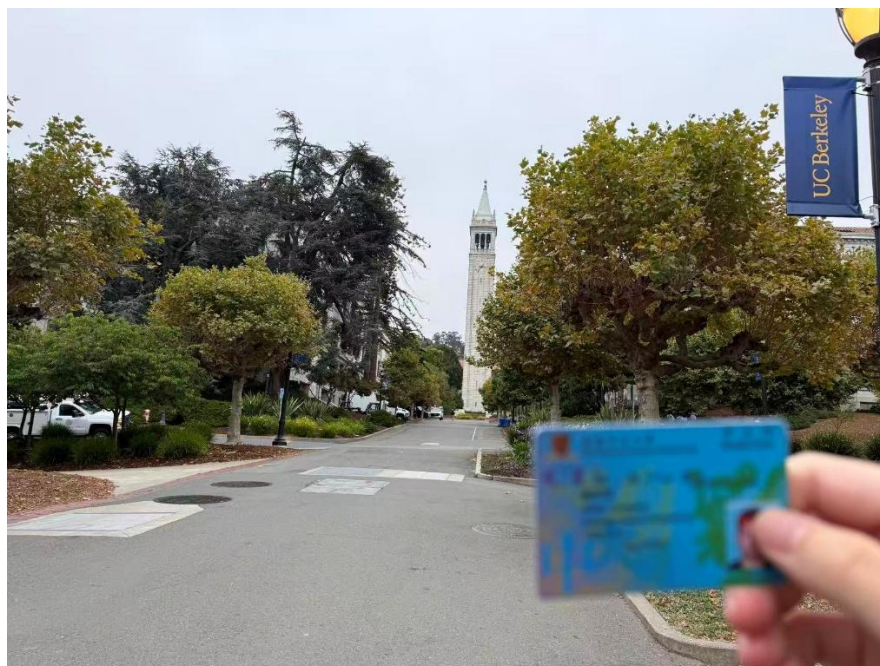
Figure 3: Sather Tower

The famous bell tower on campus, Sather Tower, is also worth admiring. For over a hundred years, its melodious chimes have accompanied generations of researchers on their journey.