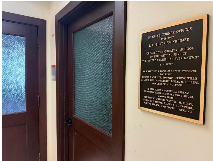
Figure 2: Offices of Oppenheimer

Berkeley has a long history, a strong academic atmosphere, and a rich culture of scientific research, having produced many Nobel laureates. While I was exploring the physics building, I was surprised to discover Oppenheimer's former office at a corner. History and the present converge at this moment.