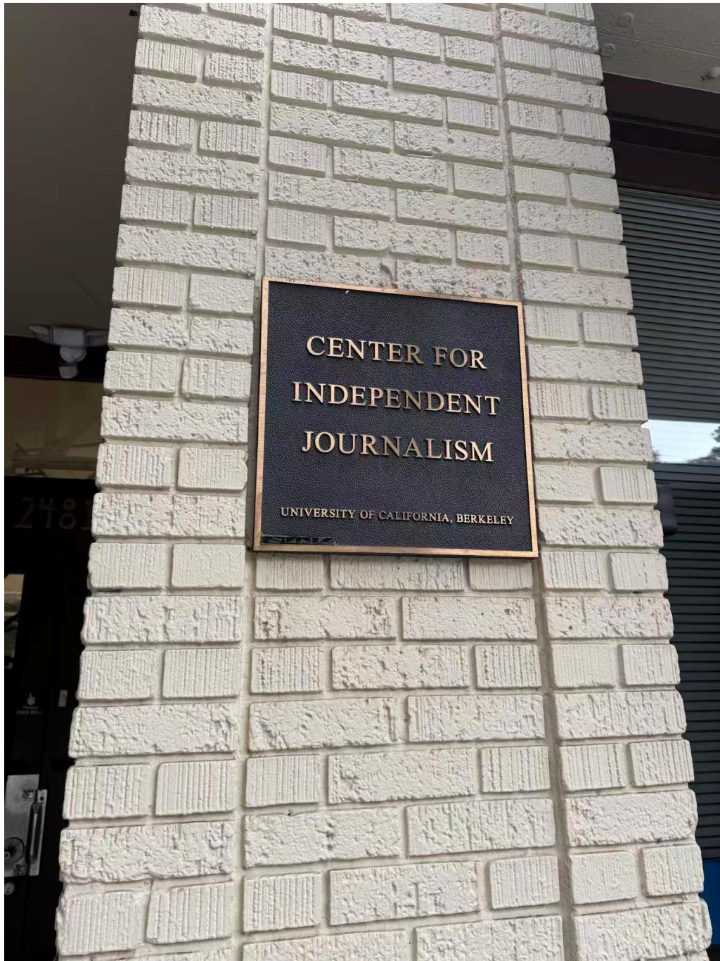
Figure 4: Center for Independent Journalism in UC Berkeley

Berkeley is known for its rich history of social movements, intellectual activism, and cultural diversity, and I could feel this energy in everyday interactions. For example, near the North Gate of Berkeley, I saw a sign for the "Center for Independent Journalism," which deeply moved me.