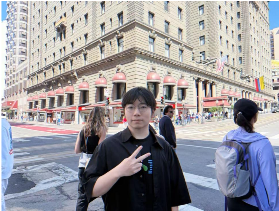
Figure 5: Me in San Francisco

During weekends, I explored the Bay Area, especially San Francisco. My friends and I went on a city walk through the streets of San Francisco, experiencing the city's unique and diverse culture.