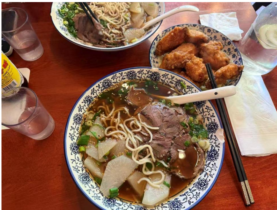
Figure 1: A Chinese Restaurant near Campus

There are restaurants from various countries near the campus, such as Thai, Vietnamese, Japanese, French, and more, where different culinary cultures blend. In my spare time, I enjoy dining with my classmates at Chinese restaurants near the campus.